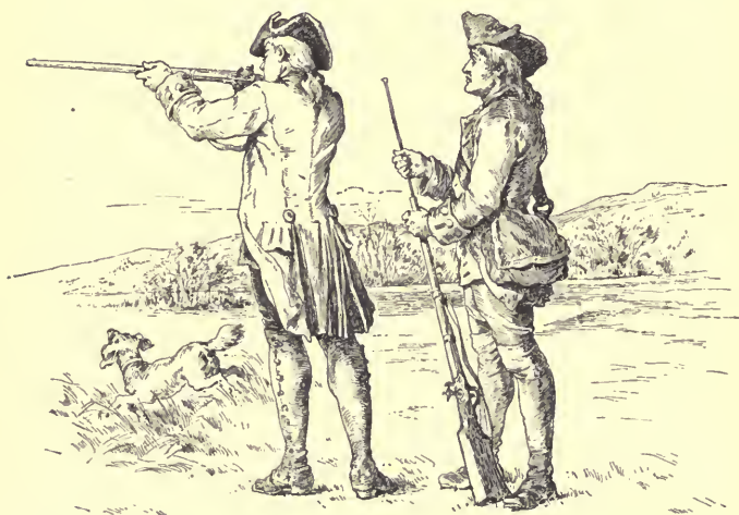
'Moriarty Carroll was always out hunting or shooting with him.'

The taste for vulgar praise grew by that it fed upon. Harry was in great danger of forgetting that he was too fond of flattery,—and too fond of company—not the best. He excused himself to himself, by saying that companions of some kind or other he must have, and he was in a situation where good company was not to be had. Then Moriarty Carroll was gamekeeper, and Moriarty Carroll was always out hunting or shooting with him, and he was led by kind and good feelings,